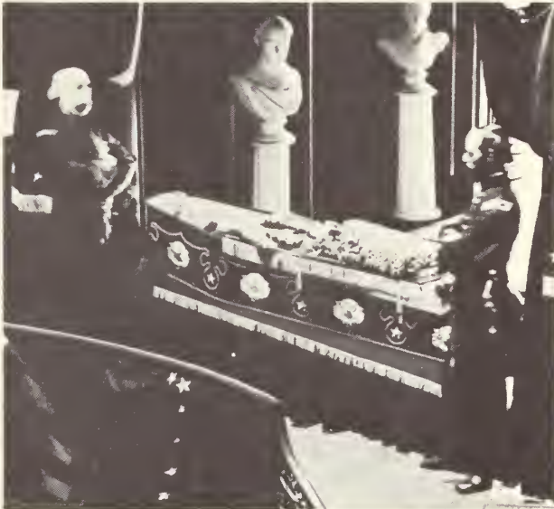
1865 (M-130) O-119 New York City, Monday, April 24, 1865.

1865 Destroyed photographs by Jeremiah Gurney of Gurney and Son, Governor's room of the New York City Hall, Mon- day, April 24, 1865.