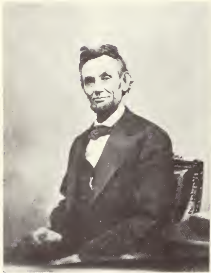
1865 (M-98) O-117