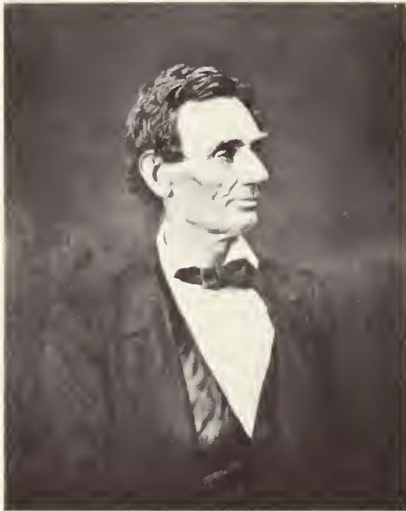
1860 (M-26) O-26 Springfield, Sunday , June 3, 1860.

Soon after Lincoln's nomination for the Presidency, photographer Joseph Hill of Galesburg traveled to Springfield to take some pictures of the candidate. He took four pictures, one of them a full-length seated portrait showing Lincoln's 18-inch boots. All the negative plates were destroyed later in a studio fire. Only a discarded print of the previous picture (O-25) survived the flames.