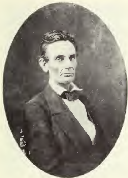
1859 (M-8) O-16, Tuesday, October 4, 1859.

The Columbus Statesman , a paper which opposed Lincoln's political views, reported: "We think Mr. Lincoln will never be invited here again, and that was perhaps his opinion, as he had his daguerreotype taken in the forenoon, with a view of leaving it, we suppose, as a remembrancer for his Columbus friends. It ought to be hung in the Young Men's Republican Club room."