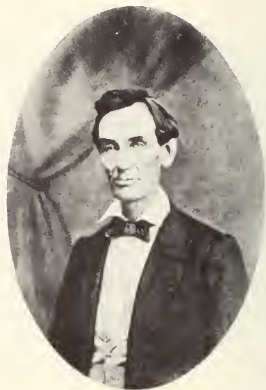
1859 (M-32) O-15 Photograph, cameraman unknown, probably in Springfield. Probably 1859.