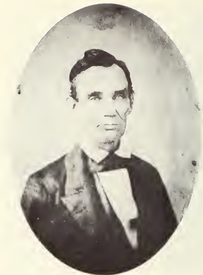
1858 (M-117) O-13 Photograph, cameraman, date, and place unknown. Probably 1858.