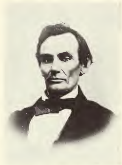
1858 (M-13) O-11