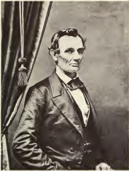
1858 (M-9) O-9 Photograph, probably by C. S. German, Springfield, Sunday, September 26, 1858.