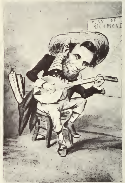
Ostendorf collection Variant head O-55

THE PHOTO-CARTOONS OF THE CIVIL WAR ERA were first drawn or painted, after which a retouched photograph of Lincoln's head was mounted on the caricature body. The cartoon was then recopied by a camera and issued as a carte-de-visite photograph.