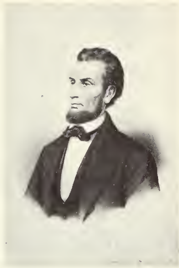
A PHOTOGRAPHIC COPY of a lithograph shows Lincoln with wavy hair. This rare French carte-de-visite was sold by E. Nuerdein in 1863 at his Paris gallery.