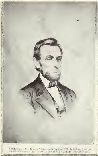
PHOTOGRAPHIC COPY of a lithograph published by Gibson & Co. in southern Ohio, 1865.