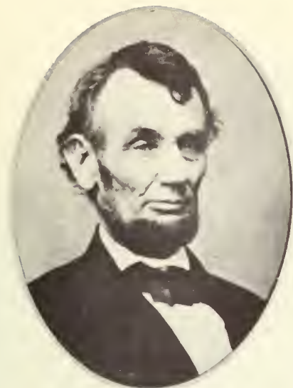
THE FAMOUS OVAL PORTRAIT adapted from the photograph of Lincoln on the opposite page and engraved on the five-dollar bill.