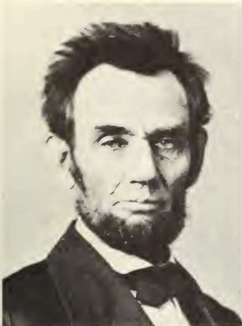
Head detail O-104

"HE WOULD RUN his fingers through his bristly black hair, which would stand out in every direction like that of an electric experiment doll."